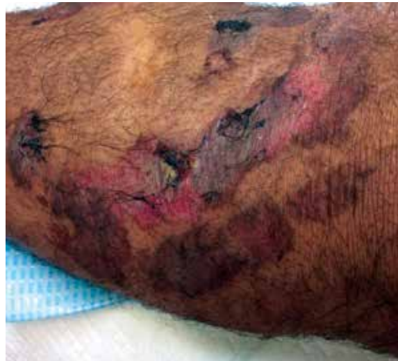
Figure 2: Close-up of superficial lesions in the left lower leg of a 33-year-old male showing different stages of healing with normal looking skin around them.