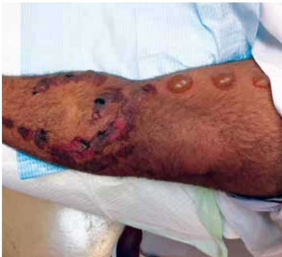
Figure 1: Horseshoe-shaped superficial crusted lesions on the left lower leg of a 33-year-old male with three identical linear bullae above the knee joint.

In our case, given the long history of recurrent lesions, their appearance, shape, and location in area