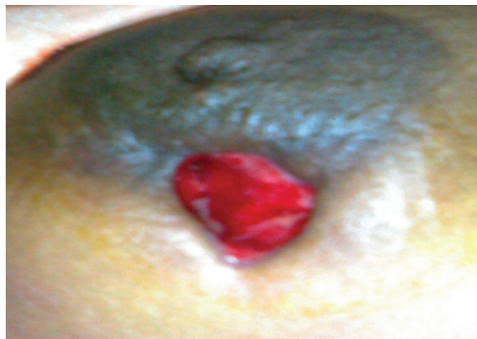
Figure 1: Photograph showing non-healing post- I&D wound.

These features suggested granulomatous mastitis. In view of chronic abscess, incision and drainage (I&D) of abscess and biopsy was done under general anaesthesia. The patient was treated with 10 days of parenteral antibiotics ceftriaxone with amikacin. Subsequently, post- I&D wound, (Fig. 1) failed to heal and the patient developed multiple superficial abscesses/sinuses around the post- I&D wound. Biopsy revealed granulomatous mastitis with Langhans' giant cell, (Fig. 2a and Fig. 2b).