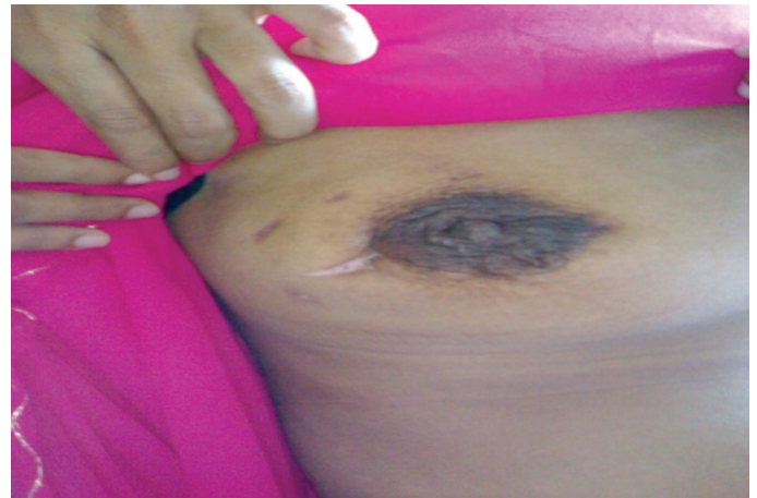
Figure 3b: Photograph after completion of ATT, on 6 months follow up.