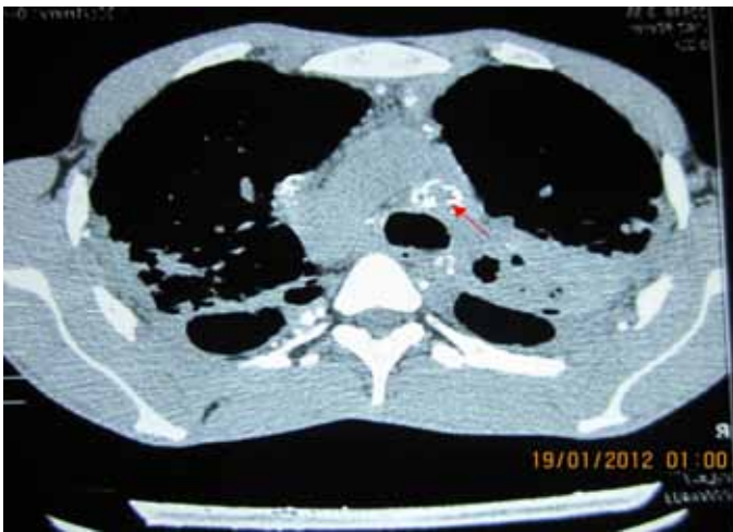
Figure 2: Egg-shell calcification seen in the mediastinal and hilar lymph nodes.