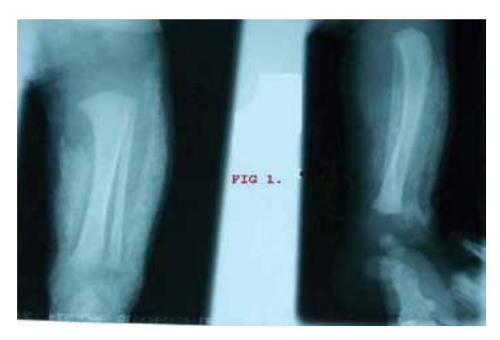
Figure 1: Anterio posterior and Lateral Radiographs of Left leg showing extraosseous ossification.

intravenous broad spectrum antibiotics. On admission, the neonate weighed 3.2 kg without any dysmorphic features. She was afebrile, non toxic, aerodynamically stable but irritable. Local examination of the left leg showed diffuse swelling of the whole leg with erythema, local warmth and tenderness. There was no local fluctuation or regional lymphadenopathy. (Fig 1)