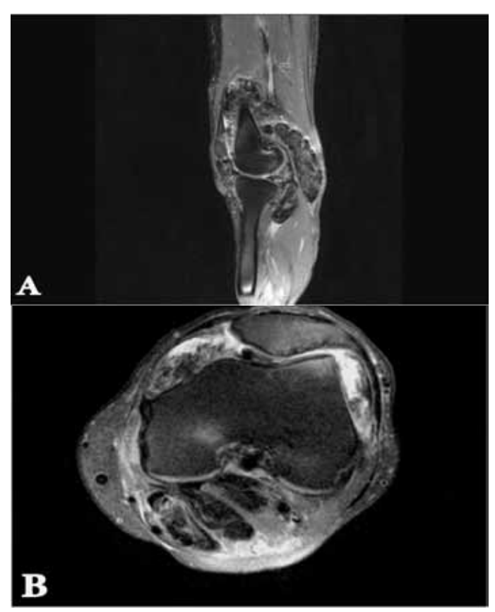
Figures 2a and 2b: Sagittal and axial proton density (PD) weighted MRI shows joint effusion with lobulated and frond-like heterogeneous hypointense lesion within the joint and bursa.