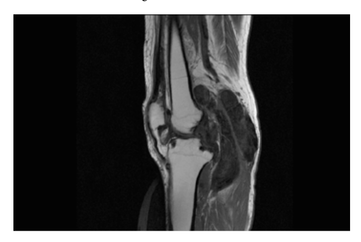
Figure 1: Sagittal T1-weighted MRI shows lobulated low signal synovial masses in knee joint and popliteal bursa with erosion of tibial condyle.

A 55-year-old man presented with swelling of left knee for the past one month. He also complained of episodes of joint locking. There was no history of pain, fever or trauma. Physical examination revealed localized increase in temperature of the skin, a large joint effusion, and decreased range of motion. His total leukocyte count was normal; ESR was raised to 48 mm in the first hour. Anteroposterior and lateral radiograph of the knee revealed large joint effusion with no bony abnormality. Subsequent magnetic resonance imaging (MRI) performed revealed joint effusion with lobulated enhancing synovial masses around the knee joint. The masses appeared low signal on T1 weighted (Fig. 1), T2-weighted and Proton density image (Fig. 2a). "Blooming effect" with marked loss of signal was seen on GRE-DESS image (Fig. 3). FNAC and joint aspiration was hemorrhagic. Synovial biopsy was performed and revealed villi and nodule with extensive hemosiderin deposition and abundant multinucleated giant cells.