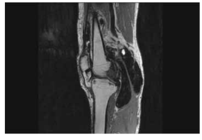
Figure 3: Shows marked loss of signal with "Blooming effect" on GRE-DESS image.