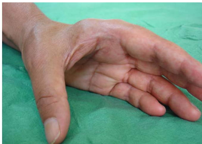
Figure 1: Mass in the dorsal first web space of the hand.

mass had slowly grown in the last year. She had consulted many physicians, including a rheumatologist and orthopedist and she was diagnosed with a simple ganglion cyst, or tenosynovitis, and treated conservatively. Examination revealed a firm, very tender, 4.0 cm, lobular, soft tissue mass without crepitus in the dorsal aspect of the first web space of the hand. Pain was exaggerated by finger motion. Radiographs showed that the soft tissue mass shadow and the underlying bony cortex were normal and clearly separated from the lesion, (Fig. 2). In the STIR sequence, MRI demonstrated that chondral bodies surround the first web space and second flexor tendon, (Fig. 3).