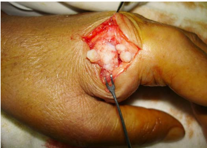
Figure 4: Intraoperative photograph showing multiple rice bodies contained within the synovial sheath distally extending.

A benign synovial tumor with calcification was considered. The most likely diagnosis was primary synovial osteochondromatosis. Laboratory studies including hemograms and biochemical values were normal, and the patient underwent a debulking procedure. When a surgical exploration of the lesion was performed, numerous shiny soft corpuscles consistent with rice bodies were found in the first web space, extending distally through the sheath to the proximal side of the second finger, (Fig. 4). Histopathologic evaluation showed benign cartilaginous tissue with overlying scant synovial tissue consistent with tenosynovial chondromatosis, (Fig. 5).