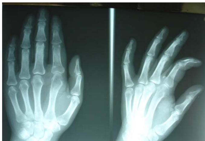
Figure 2: Radiographs exhibited soft-tissue mass shadow and the underlying bony cortex were normal.