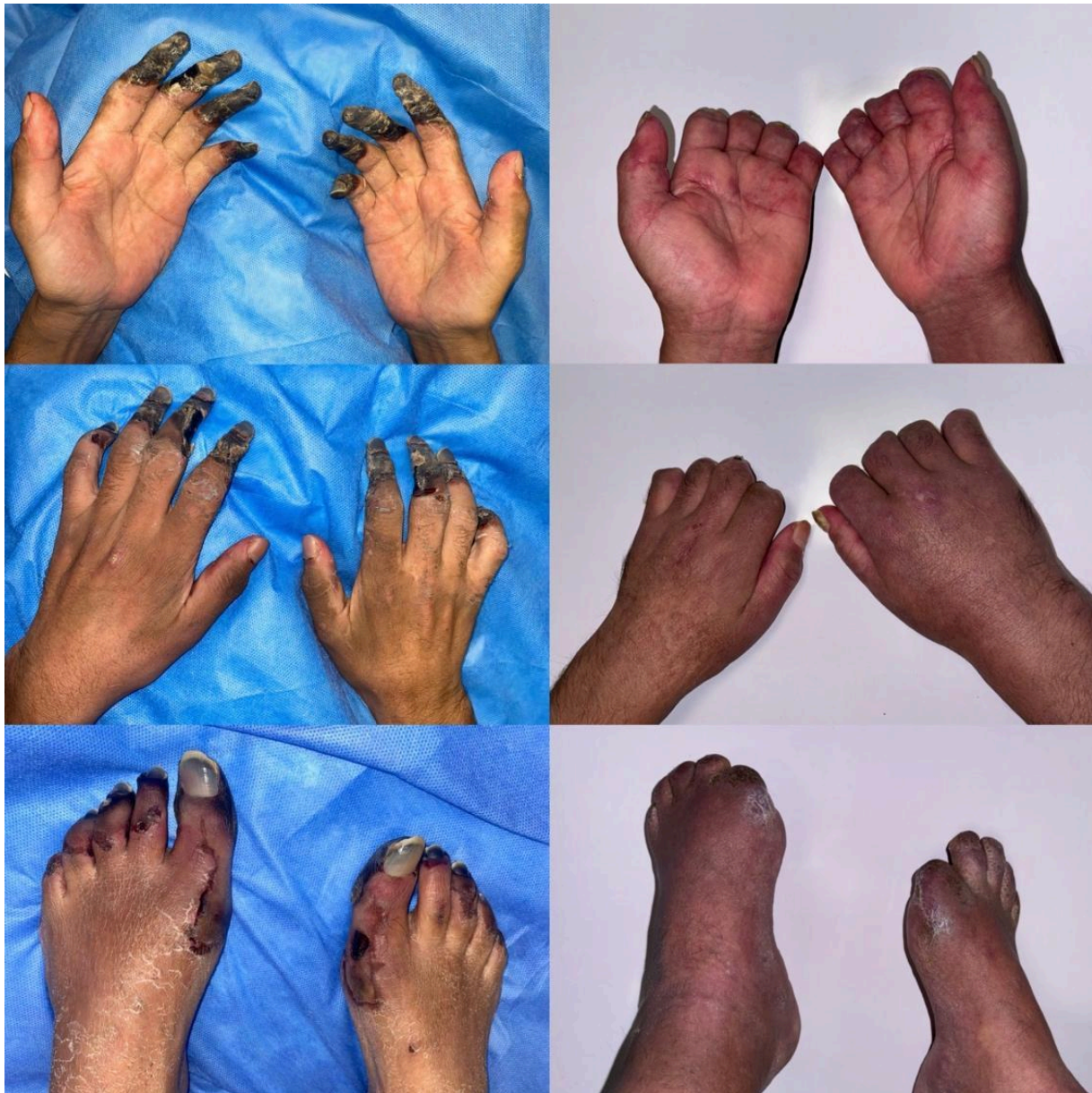
Figure 1: Necrosis of the tips of 18 fingers after not continuing rheumatology treatment for 5 months, months of follow-up after partial amputations of the 18 fingers, demonstrating good quality of distal tissue.

A 44-year-old professional pianist presented to the rheumatology clinic with bilateral digital necrosis. The initial symptoms had begun five months earlier and were associated with the recent onset of dermatomyositis. The patient was followed for two years, demonstrating good perfusion of the amputation line of the 18 fingers that had undergone partial amputation (Figure 1). The necrosis became self-limiting, and infrared thermography revealed areas of hypoperfusion in the affected fingers, which were subsequently surgically removed. Figure 2)