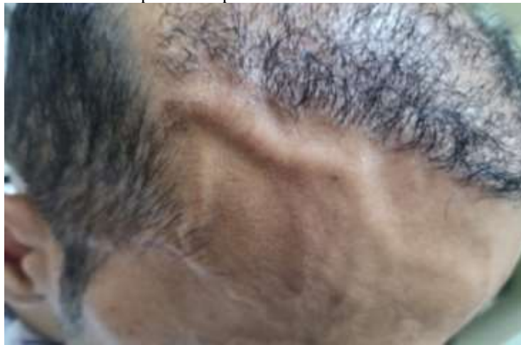
Figure 1: Close-up scalp photograph of the patient demonstrating the dilated scalp arteries and draining veins.

The patient at 8-week follow-up remains pleased with the outcome and headache has reduced significantly with no visible swelling in the frontal region. Patient followed up with a telephonic conversation and would come if he had any concerns to our out-patient department.