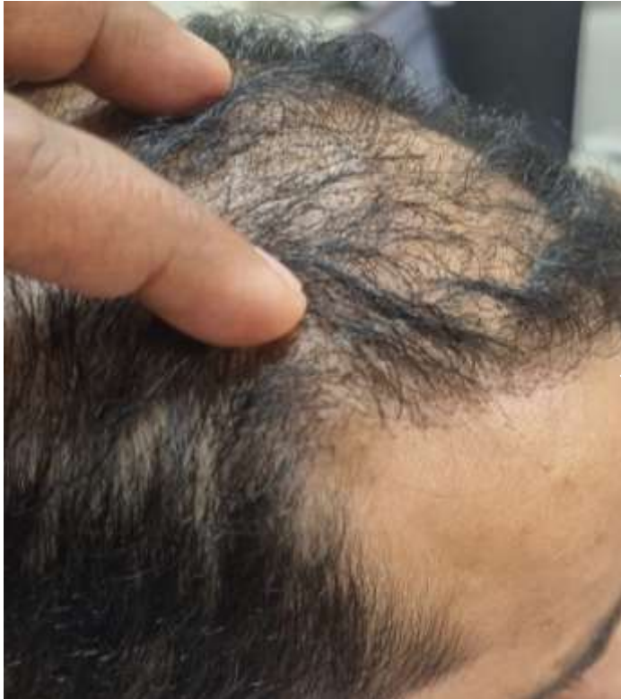
Figure 5: Thrombosed Iatrogenic Scalp AVF