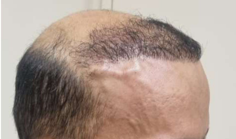
Figure 4: Post intervention appearance