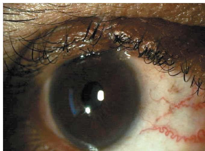
Figure 2: Reconstructed Eyelid

A provisional clinical diagnosis of peri-ocular malignancy was made and the patient was advised excisional biopsy. A wide surgical resection with 2-4 mm of clinically uninvolved skin from the temporal margin, nasal margin and bed of the tumor was performed to ensure complete removal of the lesion. The eyelid was reconstructed by re-approximating the surgical margins. (Fig. 2)